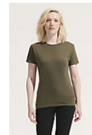
SOL'S REGENT WOMEN 01825